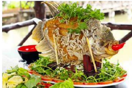
Deep fried fish in Mekong Delta