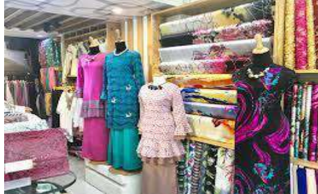
Hong Anh Collection