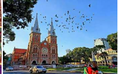
The Hundred Years Red Cathedral